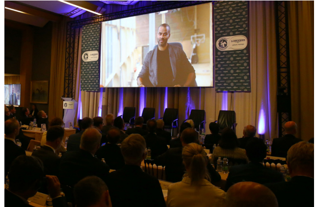
Tony Parker, former NBA player and current racehorse owner and ambassador, shared his thoughts on growing the sport