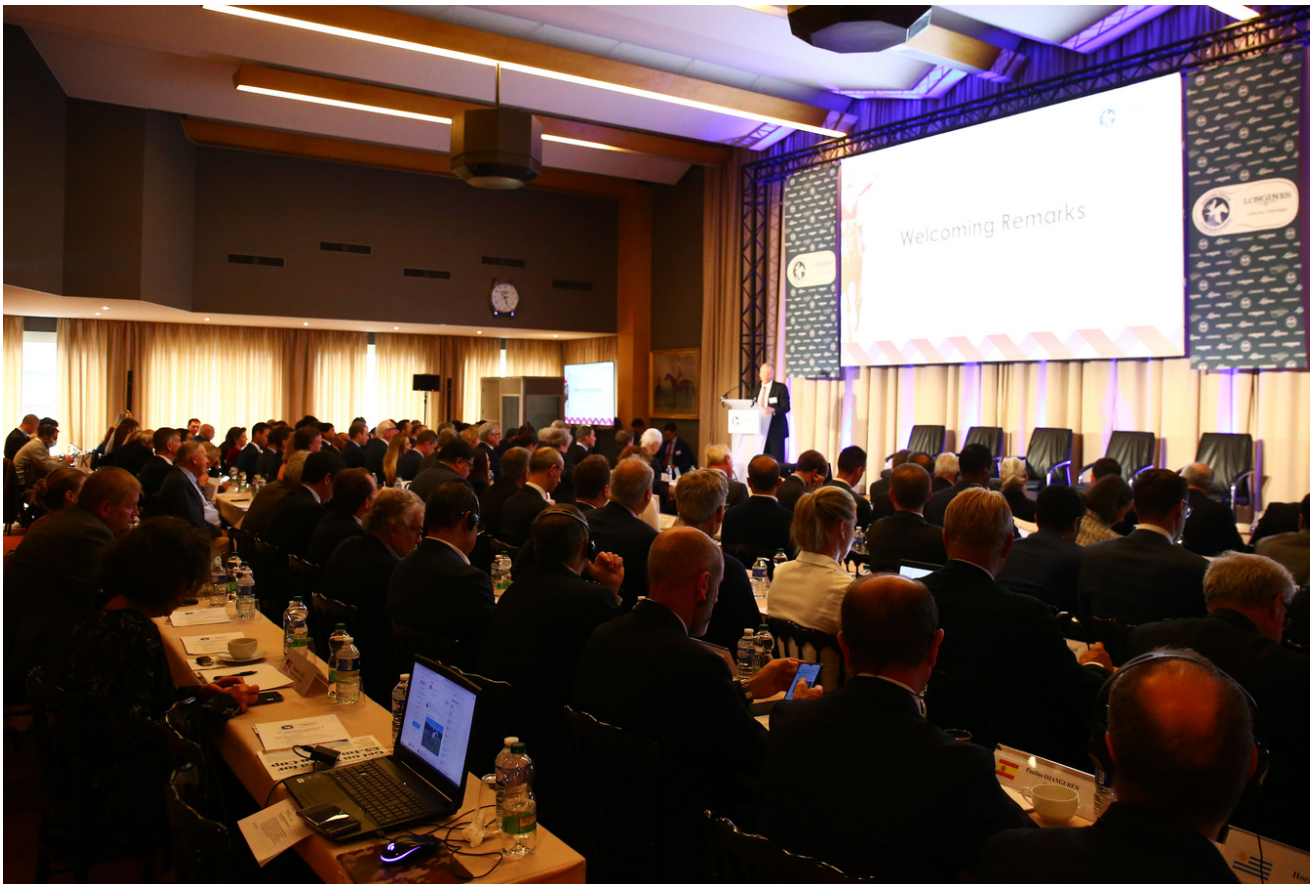
The IFHA Conference convened delegates from more than 40 different countries with a number of racing executives also in attendance.

A replay of the live video stream and the PowerPoint presentations from the Conference are all available on the IFHA website .