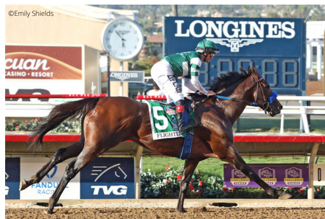
Flightline has a rating of 139, making him the highest rated horse in the world

A: You're always unsure going into the race when you are trying something new, but after being at his Saturday morning workouts and how easily he was handling the extra distance, we were very pleased with his performance. You never expect to win by 20 lengths, but Flightline is something special that we haven't seen in our industry in a very long time.