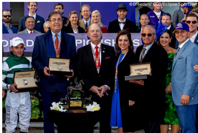
Hronis Racing also campaigned Accelerate, winner of the 2018 Breeders' Cup Classic. He was named the third best racehorse and the highest rated dirt horse in the world that season in the Longines World's Best Racehorse Rankings.